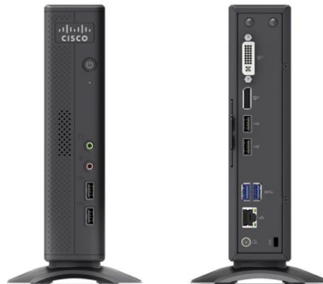
Table 1. Hardware Specifications