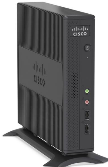
Figure 1. Cisco Virtualization Experience Client 6215

Cisco VXC 6215 is ideal for many work environments such as contact centers, shared workspaces, and telework environments. When Cisco VXC is delivered with Cisco VXME, users are able to access secure virtual desktops with integrated voice and video.